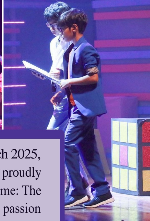
On the 20th and 21st of March 2025, Colombo International School proudly presented an adaptation of 'Fame: The Musical', bringing the energy, passion and dreams of the High School of Performing Arts to life on stage.